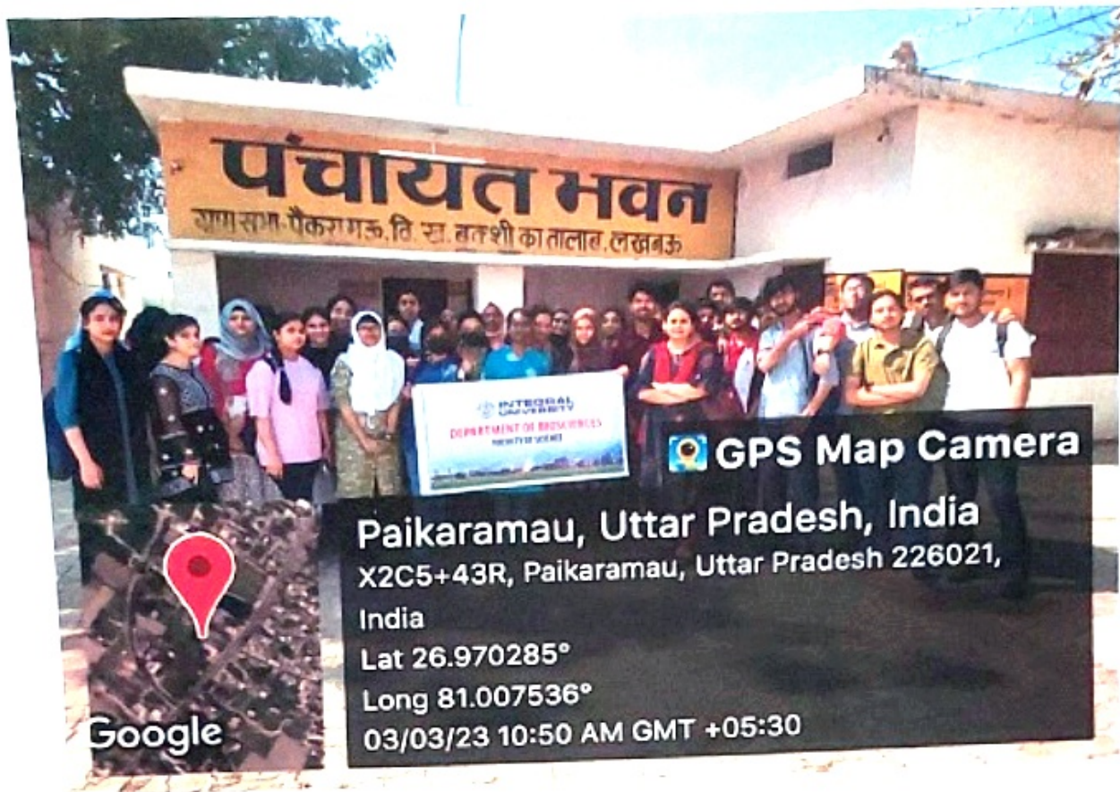
Photo 1: Bioscience students at Panchayat Bhavan, Paikaramau, U.P.